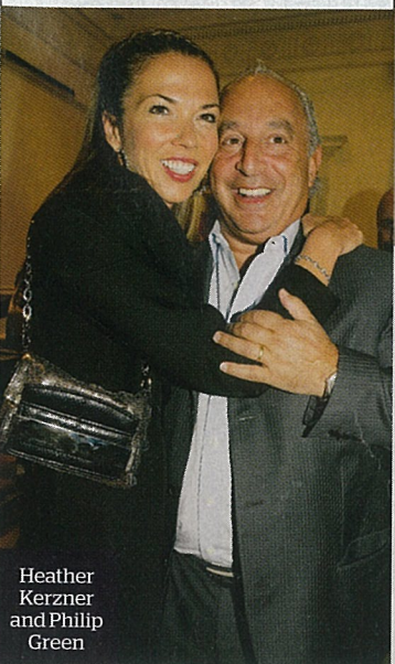
Heather Kerzner and Philip Green

What The Georgina Chapman for Garrard launch Where The Garrard flagship, W1 Who Tamara Ecclestone, Yasmin Le Bon, Kelly Hoppen, Mick Jones, Nicky Haslam and Jo Wood Food Zafferano quail's eggs, Drinks Champagne and Stolichmaya vodka cocktails with vanilla and lime Music The Puppini Sisters got the crowd going with old-school classics