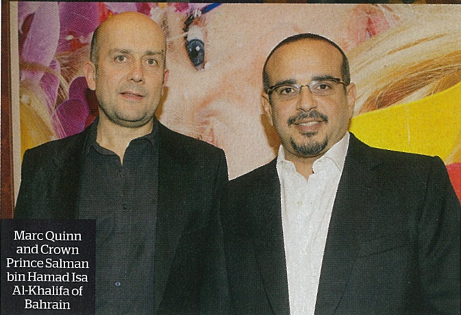
Marc Quinn and Crown Prince Salman bin Hamad Isa Al-Khalifa of Bahrain