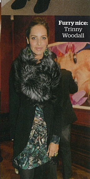
Furry nice: Trinny Woodall